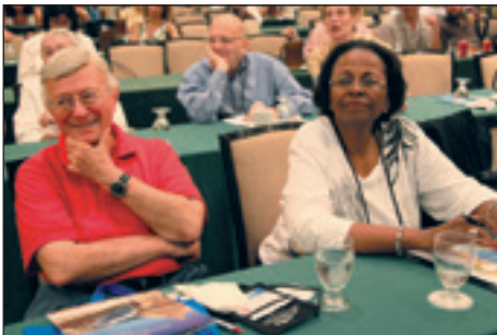
Attendees watched and engaged with a range of speakers throughout the two-day convention.