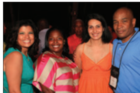
After a full day of speakers, workshops and panels, members had the chance to socialize with their peers.

access with President Obama's people," access she said would disappear if Mitt Romney were elected. ■