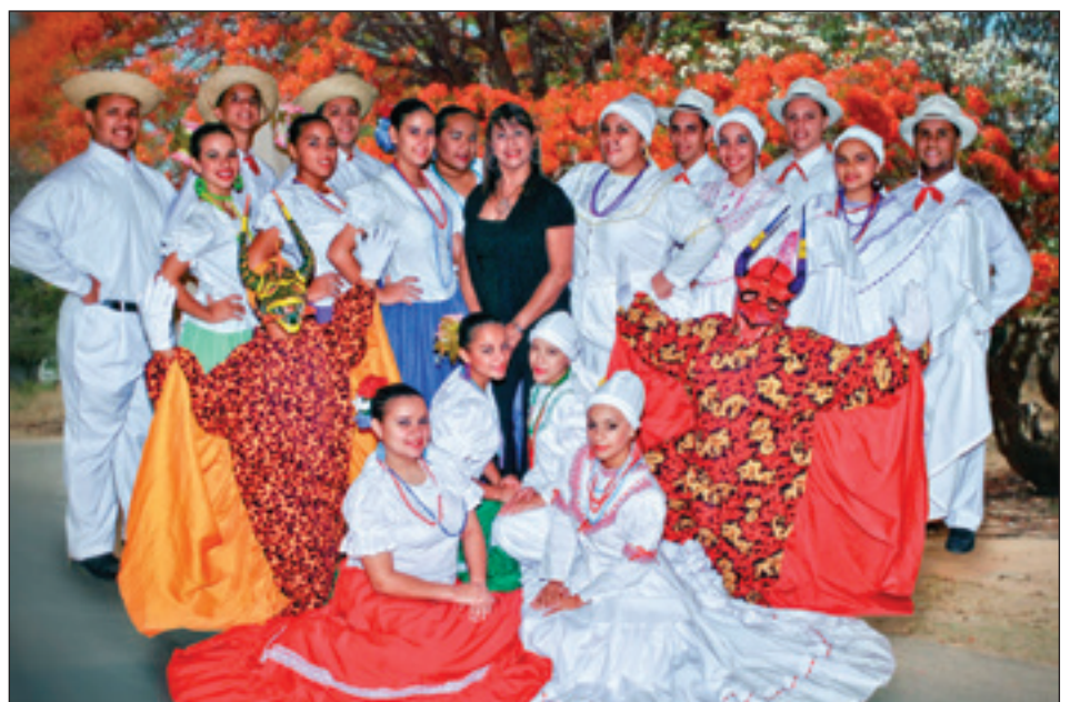
During the first night, members were treated to performances by a group of traditional dancers from Al Ritmo del Coqui from the Sudadelaida Vega School.